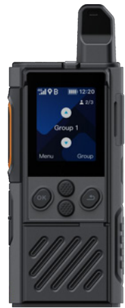
P30 Compact design, one-touch communication