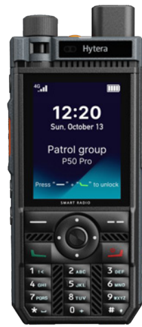
P50 Pro Application scenario detection and alert