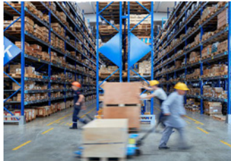
Warehousing and Logistics