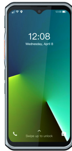
PNC560 5G security smart device (support scanning)