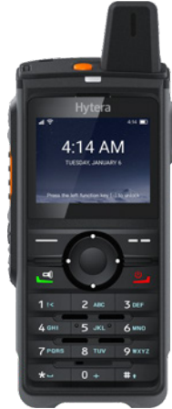
PNC380 Live-streaming dispatching