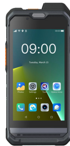
PNC460 Smart industry application device