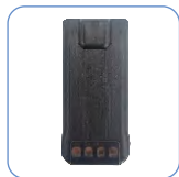
Li-ion Battery 1500mAh