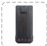
Li-ion Battery 2200mAh