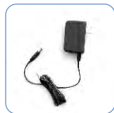
Power Adapter 12V/1A