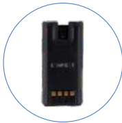
2,400 mAh Li-Poly Battery BP2402