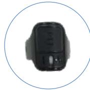
Wireless PTT POA121