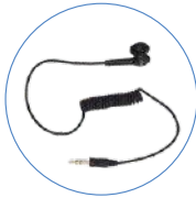
Receive-only Earbud ES-01