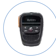
Wireless Remote Speaker Microphone SM27W2