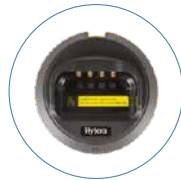
Charger (1A) CH10L29