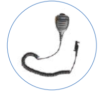
Water-proof Remote Speaker Microphone SM26N1-P