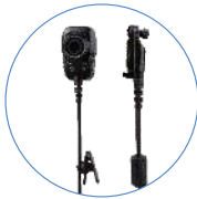
USB Camera VM220-N1