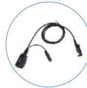
PTT&MIC Controller ACN-02P