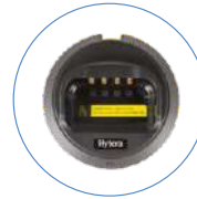
Charger (2A) CH20L13