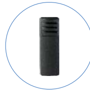
Belt Clip BC39