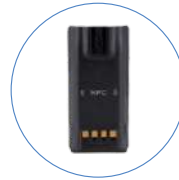
4,000 mAh Li-poly Battery BP4005