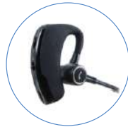
BT Earpiece EHW08