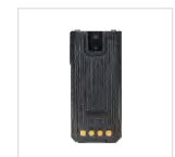
Li-polymer battery 3000mAh