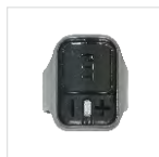
BT wireless ring PTT