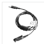
Programming cable (USB port)