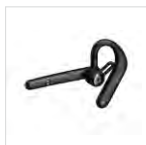
BT Wireless earpiece