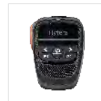
BT Wireless remote speaker microphone