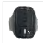
BT wireless ring PTT