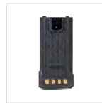
Li-polymer battery 2000mAh