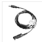
Programming cable (USB port)