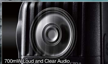
700mW Loud and Clear Audio