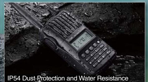
IP54 Dust Protection and Water Resistance